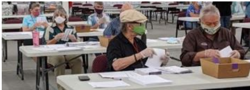
Arapahoe County election workers.

From their website: “The Arapahoe County Elections Division welcomes interested citizens to serve as temporary election workers. Positions are paid. Wages start at $13.50 per hour. Paid training is provided ... positions are open, and interviews are occurring for the November General Election. Assignments are based on applicant interest and experience, areas of election need, and political party affiliation balance. Election Judges assist voters at our Voter Service and Polling Centers across the county, or help with processing ballots at the Arapahoe County Elections Facility in Littleton.” To learn more, visit their website at arapahoevotes.com .