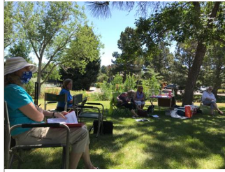
Management Team Held Annual Retreat July 11

You make the difference. Details, below.